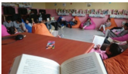
Figure 3. Reading Time in the Library

The researcher concluded that the students' goals were determined and they were informed about these goals, they were motivated to read sufficiently and they could select positive book types for their interests and they could show positive attitude towards reading.