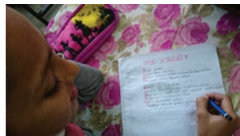
Figure 7. Poetry and Lyrics Study

In this respect, the researcher concluded that writing skills, which are the most difficult and the most difficult to apply among the four basic language skills, can be accomplished when they are realized within a certain plan and the students' tendencies towards writing are considered.