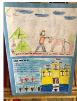
Figure 14. Painting Exhibition