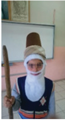
Figure 10. Drama Work