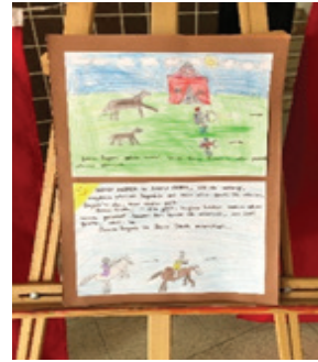
Figure 13. Painting Exhibition

At the end of the study, the students presented their paintings in the visual arts workshop and the poems they wrote in the music workshop in the painting and poetry exhibition held within the school. In addition, all the students in the study group took part in the presentation of the paintings in the exhibition. In this process, the researcher observed that the students were working with a sense of duty, taking their work seriously and showing the exhibition to their friends without harming the exhibition. In addition, the researcher observed that the students in the study group did this work fondly and willingly. In this direction, the researcher concluded that when the students were given tasks and responsibilities, they could be successful by understanding the importance of their work with a sense of responsibility.