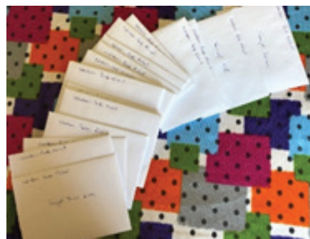
Figure 2. Letters

"What are the observations of the researcher during the application?" the findings related to the sub-problem are given below. In this section, the observer's observations are given.