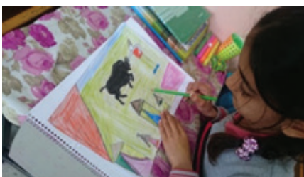
Figure 5. Drawing Work

It is known that the time period in which elementary school children can express their emotions, thoughts and dreams in the best way is painting hours. In this direction, the researcher concluded that students could enjoy expressing their emotions, thoughts and dreams, especially through painting, when they were released without being bound to ready-made forms while summarizing the books they read.