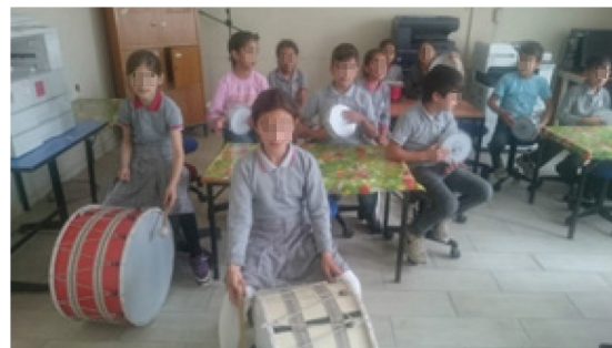
Figure 6. Rhythm Study

Within the plan determined by the researcher, the students in the study group moved to the music workshop during the free activity class hours. Here, students listened to Central Asian Turkish folk music and created rhythm songs with instruments in the music workshop. In addition, Dede Korkut and her poems about heroes have made freelance studies, wrote letters to them. The researcher observed that the students were very happy in this environment and that they were willing to write poems and letters about Dede Korkut and his stories.