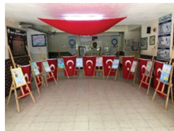
Figure 15. Painting and Poetry Exhibition