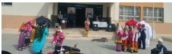
Figure 11. Drama Show

In this direction, the researcher observed that the activities carried out in cooperation with the parents were successful and contributed to the achievement of the common goal. In this regard, the researcher has come to the conclusion that the inclusion of parents of students at regular intervals will contribute to the education process.