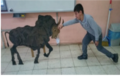
Figure 9. Drama Work