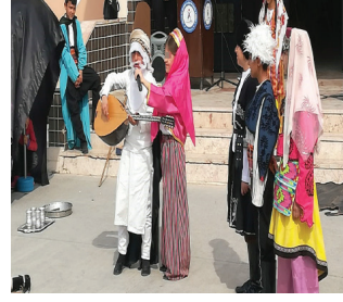
Figure 12. Song Scene