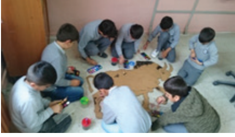
Figure 8. Drama Preparatory Work