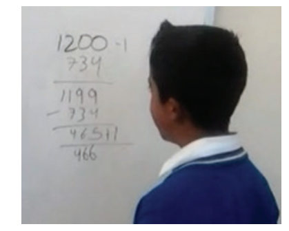
Figure 5. Modifying the written standard algorithm.