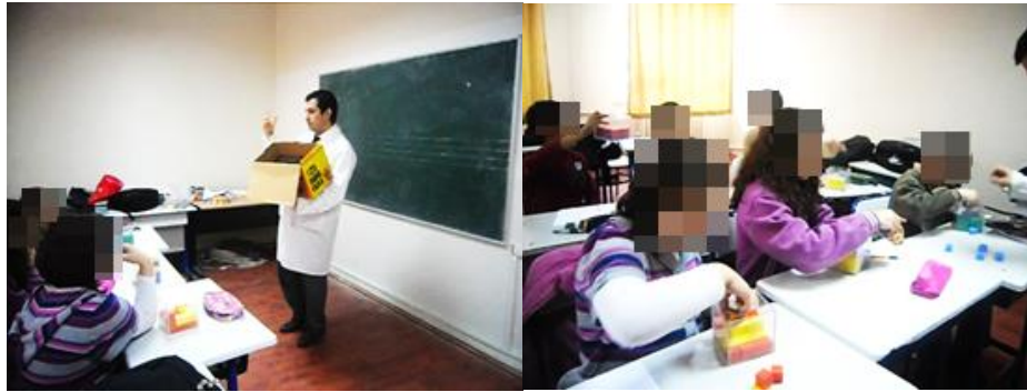
Figure 2. Scenes from the fifth session

Session 6: The division started with a problem situation given to the students (Example: Triangular pyramids and square prisms are equal in number. The total face number of square prisms is 36. Then, find the total face number of the pyramids. ). The students were allowed to examine the total face numbers of the square prisms and triangular pyramids brought into class. They found the number of the prisms and discussed the equality of the numbers of the prisms and pyramids, and they were expected to find the total face numbers of the pyramids. In line with the results they obtained, they discussed whether it was possible to write down the equation of "24:4=36:6", and the data were noted down in a table. The session was carried on with examples to develop relational thinking in the division (Sample number sentences: 60 : \square = 20 : \Delta ; 10 : (5:5) = (10:5) : 5 ).