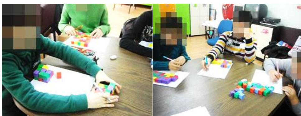
Figure 1. Scenes from the second session

Session 2: In the second session, for the purpose of observing the extent to which the students made use of relational thinking in subtraction, 30 unit cubes were distributed to the students, and they were asked to remove as many cubes as they wished and to note down the number of the remaining cubes. Following this, the students were asked to determine the minuend, subtrahend and difference after each subtraction. In the end, the discussion part started. The students were asked about the quantities (minuend) for their different operations, and the changes were examined. When they said 'minuend', the changing quantities were discussed.