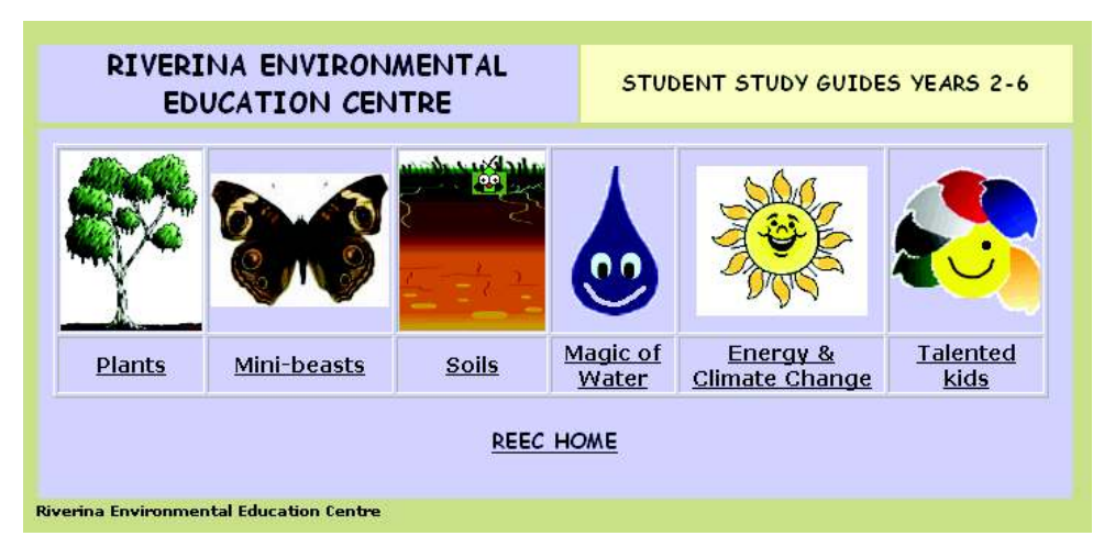
Figure 1: Available elementary e-learning activities

activities into their teaching programs. These e-learning materials are accessible to all teachers and students by accessing the REEC website (<u>www.reec.nsw.edu.au</u>). The Energy and Climate Change resource is accessed from the K-6 section of the REEC website as shown in figure 1 below.