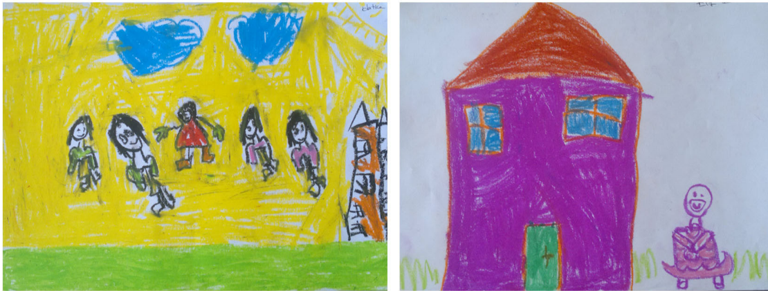
Figure 2. Example Drawings of Flat Earth

at our surroundings. They also expressed that we can see the Earth's roundness in downhill slopes. This finding is consistent with what Nussbaum (1985:179) found in his studies: Children who said that the Earth was round, but who believed that we lived on a flat Earth, explained the Earth's roundness by saying "The Earth's roundness is just the roads' curves' or 'The Earth's roundness is just the mountains' shapes". These findings shows that children cannot differentiate the astronomical conceptual framework of the planet Earth from the common sense framework of the Earth as nearby surroundings.