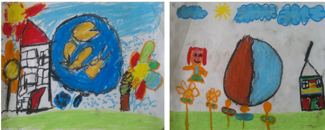
Figure 3. Example Drawings of Dual Earth

Drawings of Dual Earth: These pictures were drawn by 47 (37.90%) of the participants. In their drawings they drew both the scientific and the flat versions of the Earth. The subsequent interviews revealed that none of them believes in the existence of two Earths; one which we live on and the other which is a planet in the sky. Children were asked the reason for drawing two earths, instead of one. They replied that although they knew that the Earth is round, and there is only one Earth we live on, they also wanted to draw their home places with an Earth representation. The dual Earth pictures show separate views of the same earth, from the two different perspectives.