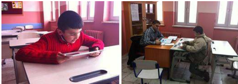
Figure 1: Treatment group

In this quasi-experimental study, 10-person student groups were determined randomly. Both groups were tested in the students' classrooms. All students performed their reading independently (see Figure 1). During the reading process, the researchers noted the number of words read incorrectly by the students for the entire period. After the reading process was completed, questions relevant to the text were asked of the students. Interviews were organized with the students in the treatment group after the students read all of the text. The students in the treatment group used tablet PCs on normal desks. The students in the control group read the same texts in their books.