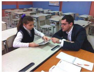
Figure 2: Introducing tablet PC

Tablet PCs were introduced to all students in the treatment group by the researchers prior to the experiment, and brief information was given about their use (see Figure 2). None of the students had any problems with the use of the tablet PCs during the application of the test.