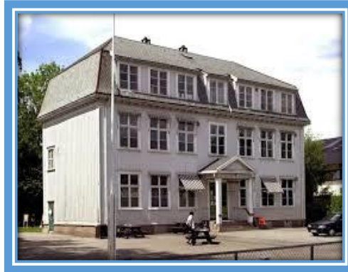
Figure 2. Hegg Elementary School, Lier, where Ole Ivar Lovaas was a student

In the school year of 1934–1935, at the age of seven, Lovaas began at Hegg Elementary School in Lier. At that time, elementary education lasted seven years. Each school year had two semesters: fall semester from August to the Christmas holiday, and spring semester from the end of Christmas holiday to the end of June.