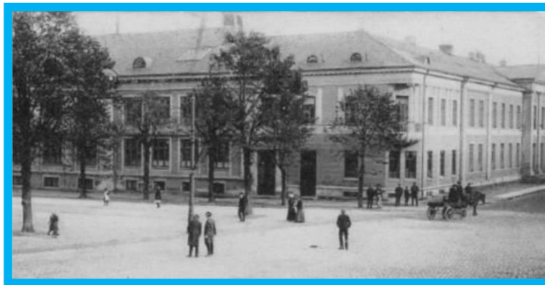
Figure 4. Drammen Latin School