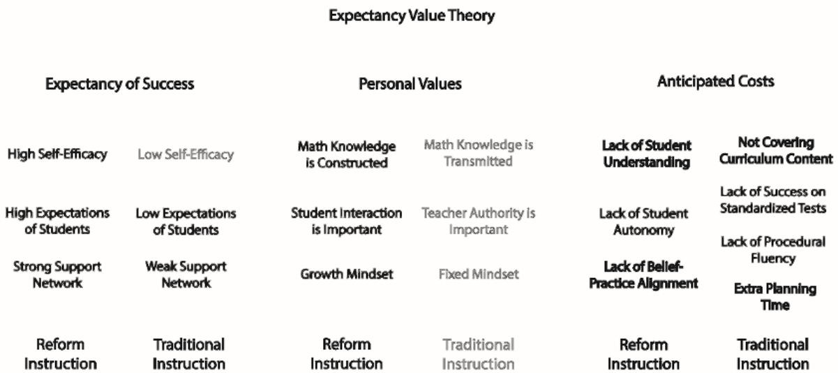
Figure 2 Revised Conceptual Model

coalesced around a single shared theme: time. None of the teachers were explicitly concerned with test preparation or procedural fluency per se. The kindergarten and second-grade teachers both felt that they did not have sufficient time to cover all of the required content included in their district’s benchmarks in the hands-on way most meaningful to young learners. They felt that testing took up too much instructional time, compounding the struggle to provide adequate time to learn concepts on a conceptual level. The fifth-grade teacher, while more sympathetic to the benefits of standardized testing, also felt that testing time frames impinged on his ability to map out his curriculum in a more optimal manner; end-of-year testing occurs in April, forcing certain concepts to be covered more than a month before the school year comes to a close. He also felt that his school day did not include enough time for him to plan for more robust math instruction.